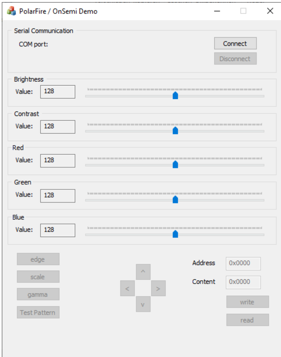
Figure 3: Windows application after startup

Next push the "Connect" button. The application is looking automatically for the COM-Port and initiate the camera and HDMI interface. After a few seconds the disabled buttons become functional and the live image is streamed over HDMI to the monitor.