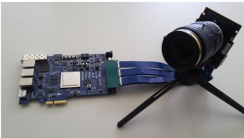
Figure 1: EVEREST VISION KIT